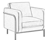
Bend Chair #228-010 32" W x 34" D x 32" H 19" SH, 21" SD, 27" AH